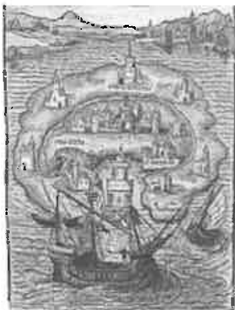
from Thomas More, Utopia (1518 edition)