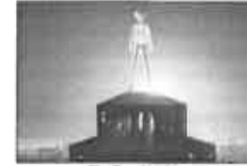
The Burning Man

Film Showing: Spark: A Burning Man Story